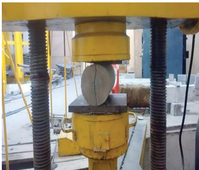
Fig. 4 Test Setup for Split Tensile test.