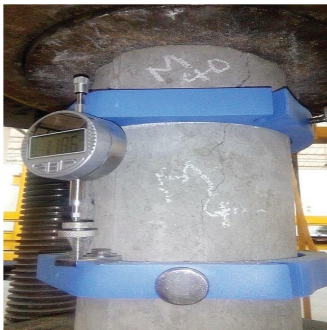
Fig. 2 Test setup for Elastic Modulus.

The workability of the geopolymer concrete for the different mixes is shown in Table 3.