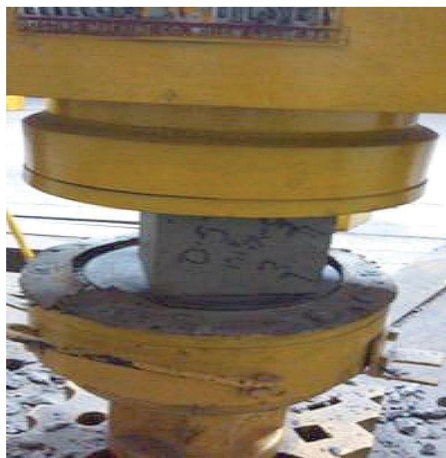
Fig. 3 Compressive Strength of Cube.