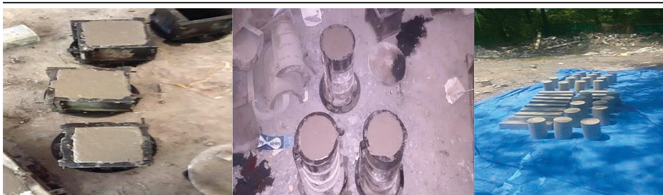
Fig. 1 Casting and curing of GPC specimens.

binder (fly ash and GGBS) was added to the aggregates and mixed for about 3 minutes; the prepared alkaline solution was added along with the super plasticizer, if any. The mixing continued for about 4 minutes until a homogeneous mixture was obtained. Before casting the specimens, the workability of the GPC in terms of slump was measured. These 3 cubes, 6 cylinders, and 3 prisms were cast simultaneously. The specimens were demoulded after one day and cured under direct sunlight until the testing day (28 days). The casting and curing of the specimens is shown in Figure 1. The mix proportions and slump values are given in Table 3.