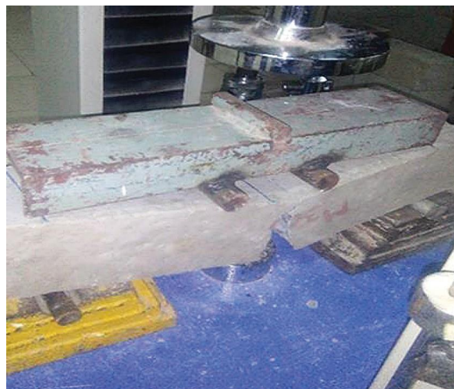
Fig. 5 Test Setup for Flexural Strength.