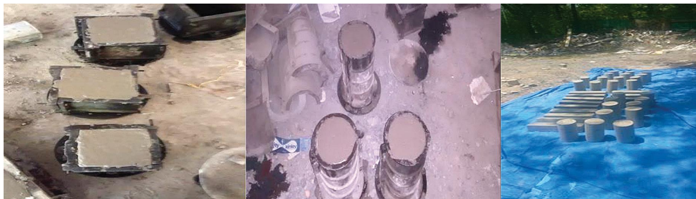
Preparation of the GPC specimens

The concrete ingredients were weight batched according to the mix proportions given in Table 2. Initially, the coarse and fine aggregates were dry mixed in a Hobart mixer for 3 minutes. Then the Fig. 1 Casting and curing of GPC specimens.