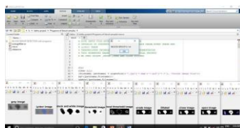
Figure 5.2: Simulation of Output Blood Sample

Command window displays the resulting values of every command which is given in the program that is written in Editor window. From this project, the pixel values of the input image can be viewed easily through the command window and the corresponding input image can be viewed in figure 5.1