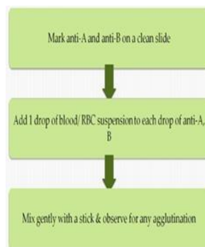
Figure 1: Blood Grouping–Slide Method

The slide test is relatively the least sensitive method among others for BG determination, but due to its prompt results, it is very much valuable in emergency cases. In this method, a glass slide or white porcelain support is divided into three parts, as for each part, a drop of donor or recipient blood is mixed with anti-A, anti-B and anti-D separately. The agglutination or blood clumping pattern can be visually observed from which the ABO and rhesus D (Rh D) type of blood can be determined. The test completes in 5–10 min and is inexpensive, which requires only a small volume of blood typing reagents. However, it is an insensitive method and only useful in preliminary BG matching for getting an early result. The test cannot be conducted for weakly or rarely reactive antigens from which the results are difficult to interpret, and additionally, a low titer of anti-A or anti-B could lead to false positive or false negative results. Although the slide test is useful for outdoor blood typing, it is not reliable enough for completely safe transfusion.