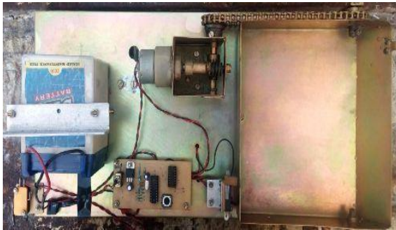
Fig.1 Dumping Rail

There are many ways to transport the garbage from towns to their dumping yards, mainly trucks, tractor trolleys, tippers, etc are used, but nowhere in the world rails are used, there by this innovative idea is presented here to transport huge quantity of garbage through wagons. To prove the concept practically, a prototype module with one autonomous dumping wagon is designed for live demonstration. Entire system is designed to operate at 12V DC, for this purpose 12V, 4.5AH rechargeable lead acid sealed battery is used, this is a heavy duty battery and used for long back-up time. The motors required 12v dc, so this voltage as it is used to run the motors through H Bridge IC, where as for control circuit and horn circuit different DC levels are required. Since the control circuit is designed with microcontroller IC, 5V regulated supply source is essential and there by using 7805, 5v regulator, stable supply is derived, similarly for horn circuit using 7809, 9v regulated supply source is created. In addition the battery is charged with 13v unregulated power source which is not accommodated over the chassis of train.