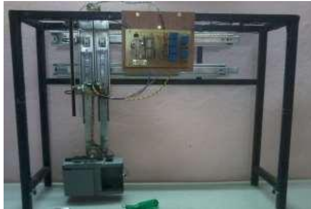
Fig 1. Elevator System

A lift is really a device, generally employed for vertical transportation of travelers or freight to various flooring or levels, as with a structure or perhaps a mine. The word elevator generally denotes one with automatic safety products the earliest models were known as hoists. Lifts contain a platform or vehicle travelling in vertical guides inside a shaft or hoist way, with related hoisting and lowering systems along with a power source. The introduction of the current elevator profoundly affected both architecture and also the mode of growth and development of metropolitan areas by looking into making many-storied structures practical. Now-a-days lifts mainly contain a shaft where the vehicle (also referred to as cab) rises and lower. In “traction” lifts the vehicle is drawn up with the aid of steel ropes, which rollover the top of the grooved lever. The burden from the vehicle is generally balanced having a counterweigh