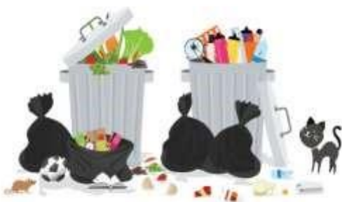
Fig 1. Existing system

In the existing system garbage is collected by corporation by weekly once or by 2 days once. Though the garbage shrinks and overflows the garbage bin and spread over the roads and pollutes the environment. Pollution may lead to occurrence of various diseases. In existing system people were throwing garbage in the large bins and the garbage used to overflow on roads and spread on the roads, because of these the pollution is spread into an environment as well as harm the environment. Because of contaminated environment diseases are spreading fast. The large garbage bins in the cities were overloaded and municipal corporation was not knowing about the overloaded bins. Small carts were arriving in the towns to collect the garbage and people staying in the apartments could sometimes cannot throw the garbage in the carts because till they get down the carts were went far. These system is creating a problem to the environment as well as people. Garbage bins are not managed properly they are overflow and spread contaminants in the pollution. The street dogs and animals eat the waste food and spreads over the area and creates dirty environment to avoid such situation we are planning to design IOT Based Garbage Management For Smart Cities.