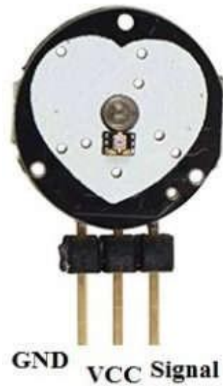
Fig 2: Pulse Sensor

This sensor merges a simple optical heart rate sensor through a circuit. This circuit is used for noise cancellation & amplification to get consistent pulse readings very quickly. It uses 4mA of power at 5V, so it is very useful in mobile applications. This article discusses an overview of pulse sensors and their working with applications.