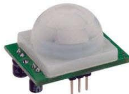
Fig 4: PIR sensor

The electronic sensor used to detect the movement of human being within a certain range of the sensor is called as PIR sensor or passive infrared sensor (approximately have an average value of 10m, but 5m to 12m is the actual detection range of the sensor). Fundamentally, pyroelectric sensors that detect the levels of infrared radiation are used to make PIR sensors. There are different types of sensor and here let us discuss about PIR sensor with dome shaped Fresnel lens.