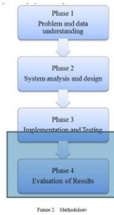
Fig. 2. Methodology

i. Able to help to lecturers to automatically predict students performance System analysis and performance.